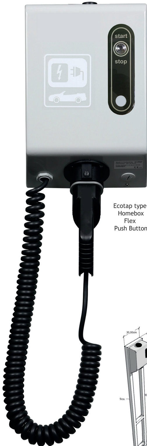
Ecotap type Homebox Flex Push Button