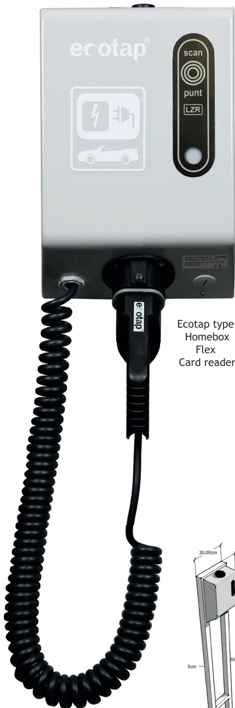
Ecotap type Homebox Flex Card reader

Plug type 1 or 2 , 16Amp 1 phase, up to 3.7 kW Plug type 2 , 16Amp 3 phase, up to 11 kW Plug type 2 , 16Amp, 1 phase, up to 7,4 kW Plug type 2 , 16Amp 3 phase, up to 22 kW